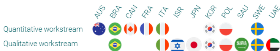
FIGURE 1: COUNTRY COVERAGE BY WORKSTREAM

The geographic scope of the project included 12 countries, namely Australia, Brazil, Canada, France, Italy, Israel, Japan, South Korea, Poland, Saudi Arabia, Sweden, and the United Arab Emirates. Countries that are usually ahead of the UK in the product launch sequence (e.g., Germany or the USA) were excluded. Figure 1 provides an overview of the countries included within each workstream. The results from both workstreams were combined to reach an overall conclusion related to the two research questions stated in Section 1.2 Error! Reference source not found.