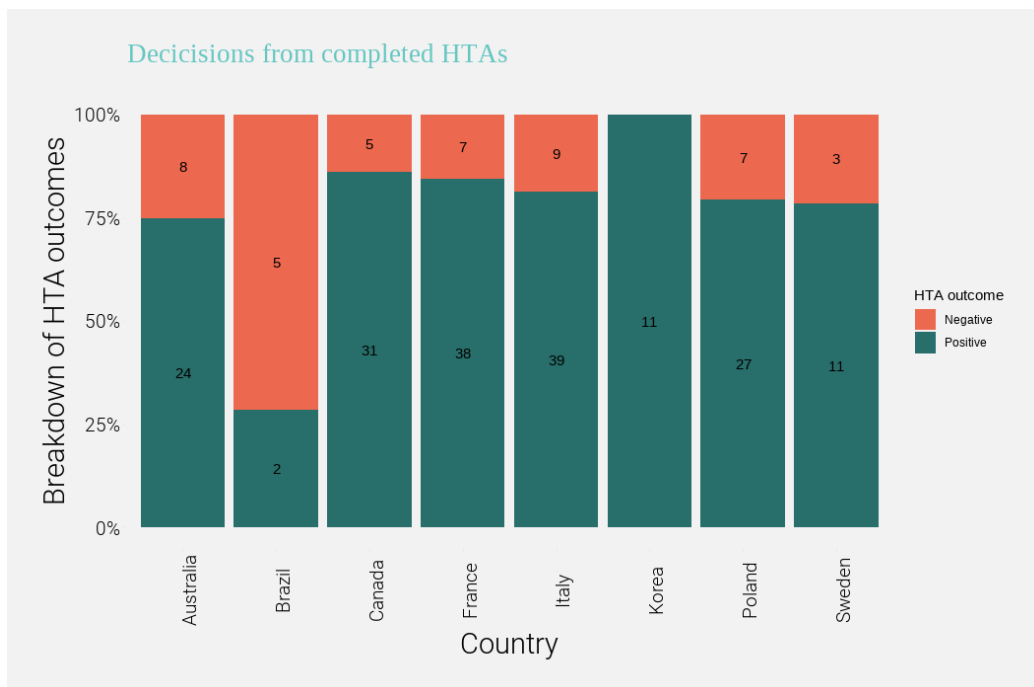
FIGURE 3: DECISION OUTCOMES OF COMPLETED HTA.

Focusing only on completed appraisals (after removing two terminated appraisals in Australia and one terminated appraisal in Poland), Figure 3 shows that most countries have a positive recommendation rate above 75%. This compares to NICE's positive recommendation rate of 90% for all completed (7 terminated appraisals excluded) appraisals.